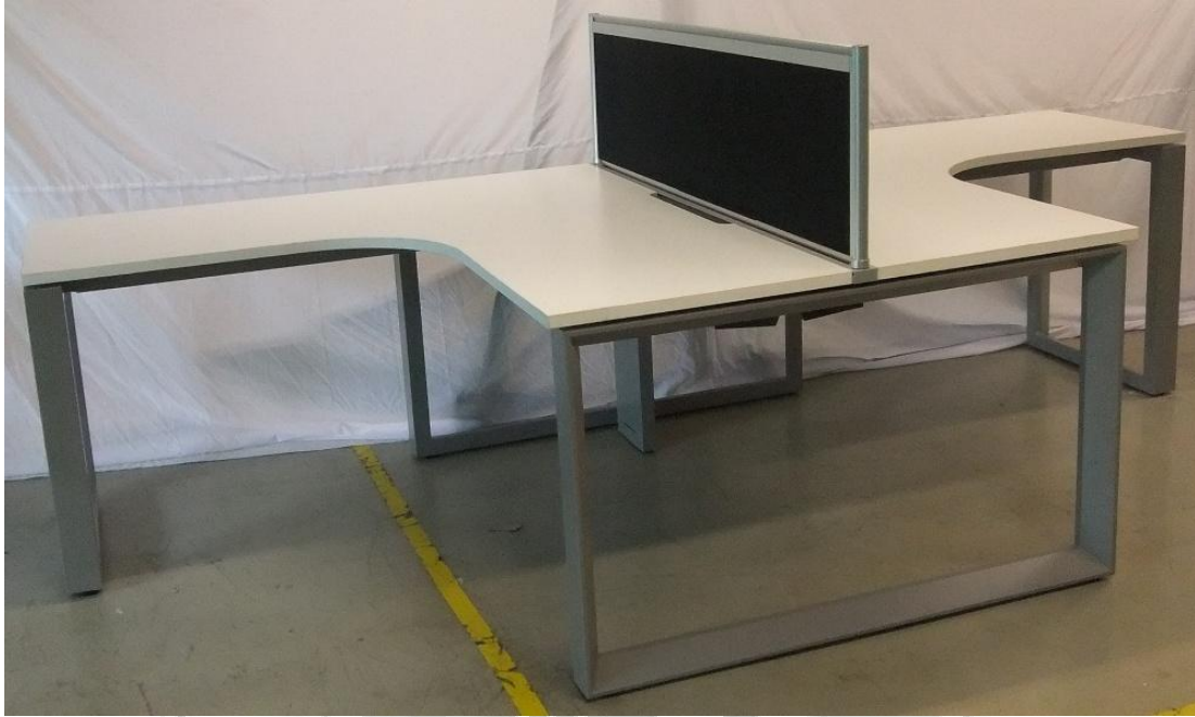
Photograph: SOLO System Series